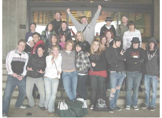
YLB members finish up another great training