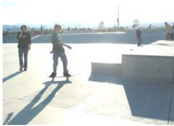
Riders at the local skate park

Phoenix Alliance members in St. George were lucky enough to be part of the local skate competition held on September 15 th . It was hot & sunny, but most importantly, we got the word out. We had a whole bunch of swag for the kids, including some wicked hats, a custom skate deck from The TRUTH, not to mention some stylin' shades.