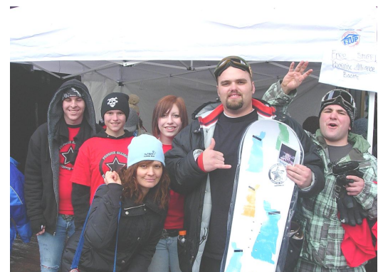
The lucky winner of the snowboard with members of the Phoenix Alliance

For the Great American Spit Out, we pushed our petition to eliminate tobacco advertising in college rodeos at Brighton Ski Resort. To help with our message, we had a funny face contest. People competed against each other for the funniest face, but we threw in some pictures of faces damaged by spit tobacco. The winner won a brand new revolution snowboard!